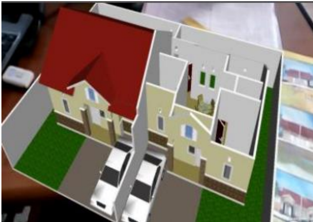
Figure 2 Marketing Media using Augmented Reality (Asbara, 2021)

Meanwhile, markerless-based tracking is an improvement over the previous marker-based tracking technique. With this technique, users no longer need to use markers to enjoy augmented reality technology. Markerless-based tracking is widely implemented in various fields, including human face recognition, motion tracking, GPS-based tracking, and 3D objects. Several examples of AR implementation to introduce tourist attractions in various regions can be seen, such as the one depicted in Figure 2, the use of AR applications for tourist attractions in Makassar City. The design of the AR-based Makassar Tourism Application using Area Markers aims to facilitate tourists visiting Makassar in finding nearby tourist locations and providing information about related attractions in the form of augmented reality.