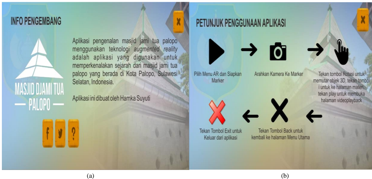
Figure 5. Application Description and User Instructions

In Figure 5, part (a) provides developer information and a description of the application. Part (b) of Figure 5 displays the user instructions for the application, including selecting the AR Menu, preparing the Marker, aligning the camera with the marker, performing rotations, featuring the exit button and returning to the main menu function.