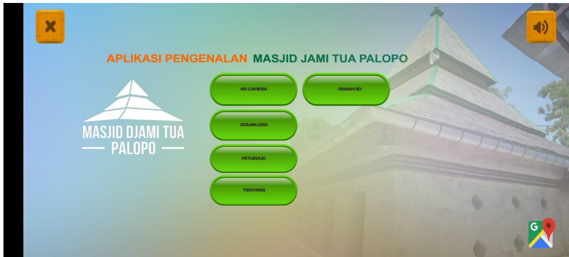
Figure 3. Main Page.

Figure 3 illustrates the implementation result of the main menu in the cultural recognition application for the Old Jami Mosque of Palopo. The menu offers several user-accessible pages, including the AR Camera menu, 3D Design menu, marker download menu, system usage instructions menu, and About menu.