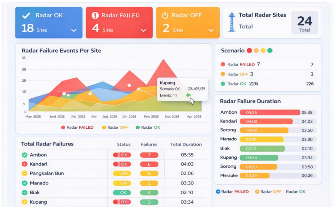
Figure 3. Radar Monitoring Dashboard

This dashboard presents key information on radar conditions in the MATSC FIR area, including the number of radar sites with FAILED status, the number with OFF status, the radar site with the longest interference duration, and the radar site with the highest number of failure events. This information is presented as statistical visualisations to make it easier for users to understand the overall radar condition. In addition, the dashboard displays a graph of radar failures at each radar site over a specified period, enabling technicians to identify sites with high interference.