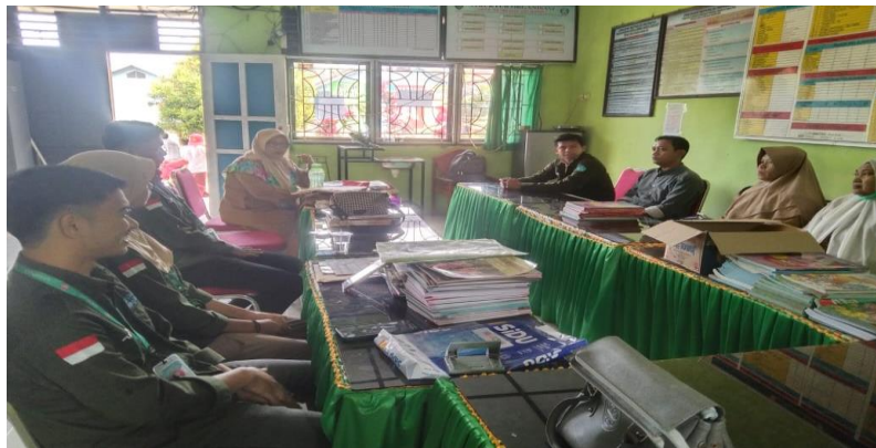
Figure 4. Counseling for Principals and Teachers