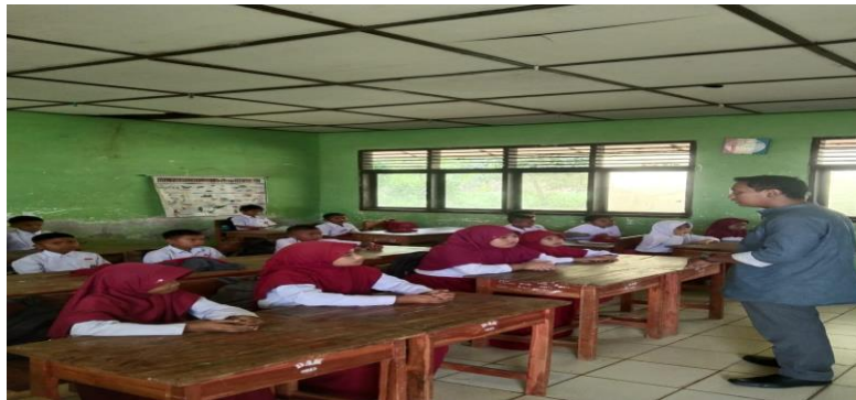
Figure 3. Counseling to Students