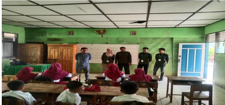
Figure 2. Counseling to Students