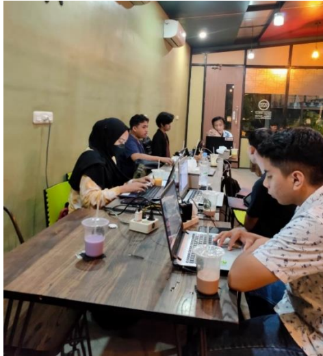
Figure 4. Participants attend training

laptops, participants immerse themselves in the practical aspects of website creation. This direct engagement not only solidifies their understanding but also provides an immediate opportunity for problem-solving and the clarification of any doubts that may arise during the application of newly acquired knowledge.