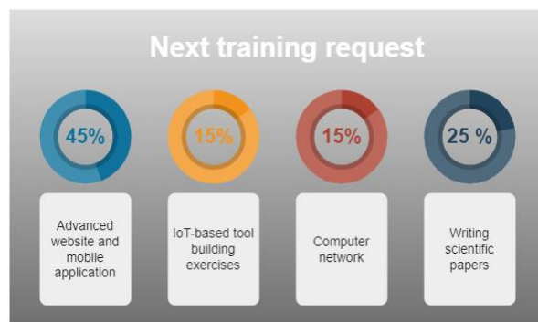
Figure 3. Graph of the results of the next training interest survey

Overall, the participant satisfaction level for the 8-session training program reached an impressive 97.5%. Encouragingly, participants expressed a keen interest in additional training sessions from the lecturer's service for this activity. Specifically, their requests for further training were as follows: advanced training on websites and mobile applications (45%), advanced IoT training (15%), computer network training (15%), and training on writing scientific papers (25%). Figure 3 illustrates the graphical representation of participants' interest in upcoming training sessions.